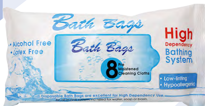
Item No.: LIVB850

Alcohol-free – ensures a soft, soothing cleanse without irritation