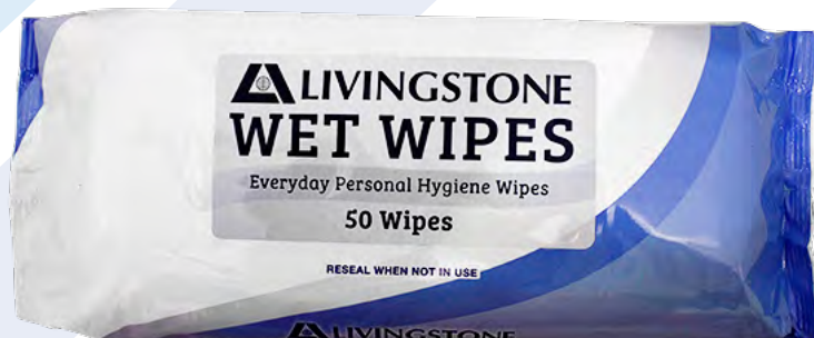
Item No.: KIM94128N