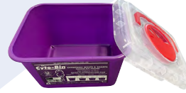
Item No.: DSS004INP