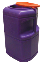
Item No.: DSS020CT Item No.: T5PI190PLL

BUY FROM OUR WEBSTORE WWW.LIVINGSTONE.COM.AU AND GET THE LATEST RANGE AND BEST PRICES