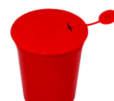
Item No.: A7000

BUY FROM OUR WEBSTORE WWW.LIVINGSTONE.COM.AU AND GET THE LATEST RANGE AND BEST PRICES