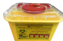
Item No.: DSS004IN