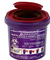
Item No.: T8PI014YNP