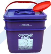
Item No.: DSS010P