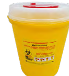
Item No.: T5PI080YNS