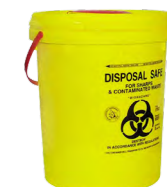
Item No.: DSS020