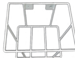
Item No.: DSSBTW2