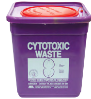
Item No.: DSS004P