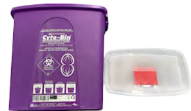
Item No.: DSS023P