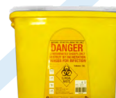
Item No.: DSS015