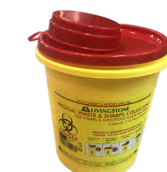
Item No.: T8PI014YNS