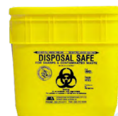
Item No.: DSS010