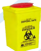
Item No.: DSS002