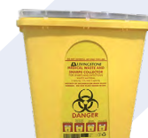
Item No.: DSS023