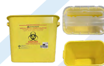
Item No.: DSS010N