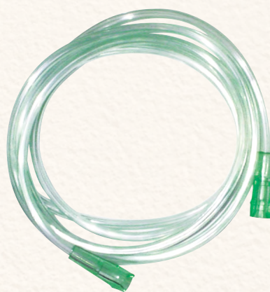
Item No.: OXYTUBE2M