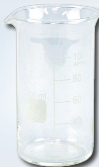
Item No.: 1802-0100N