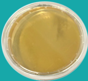
Control Swab (pre-massage)