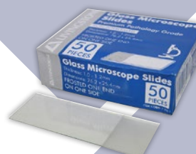
Item Code: 7105-1