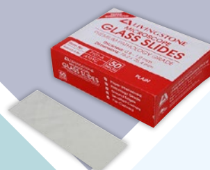
Item Code: 7101-A