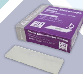
Item Code: 7103