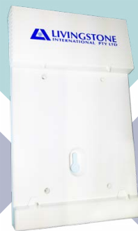
Item Code: DRACULA