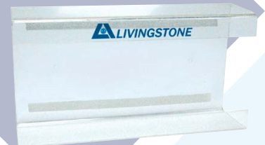
Item Code: GLVDISP100