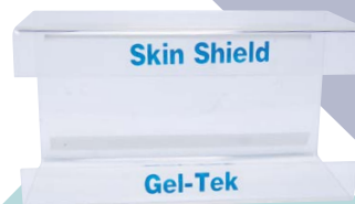
Item Code: GLVDISP100S