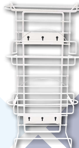
Item Code: ZSSGB008