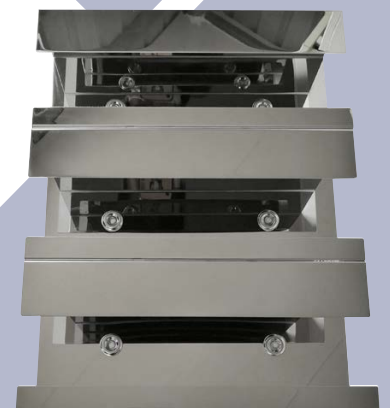
Item Code: 3SSGLOVESDISP